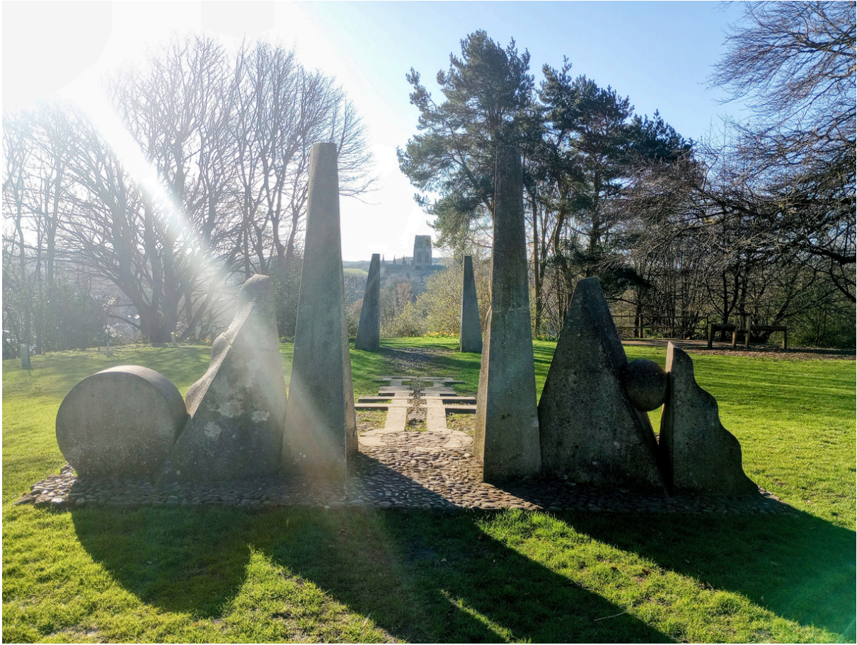
“The Way” by Hamish Horsley, 1990