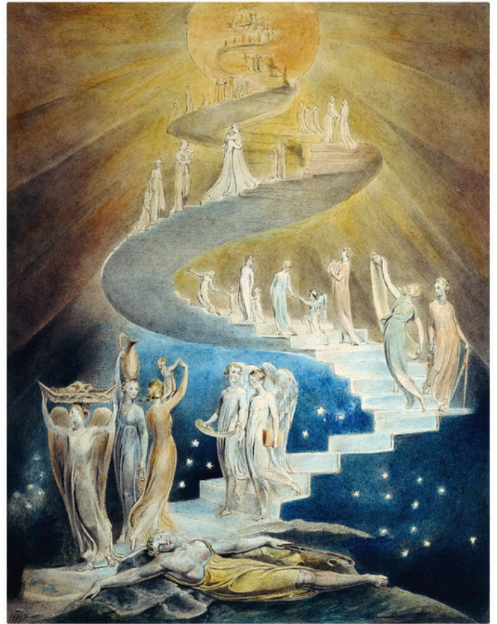
Jacob's Ladder, 1805 by William Blake