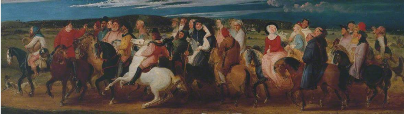
"The Pilgrimage to Canterbury" by Thomas Stothard (1755-1834)