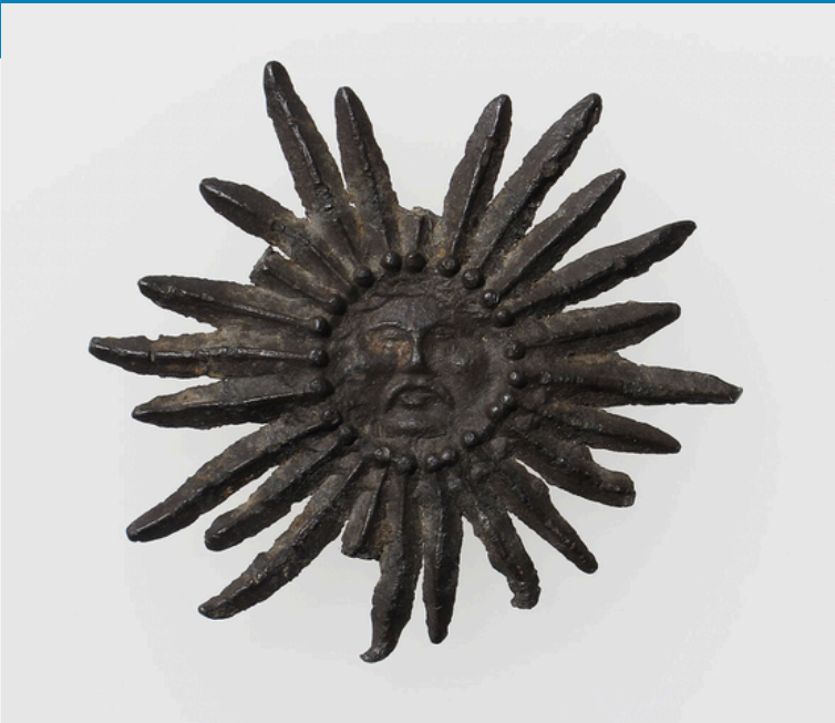
Pilgrim's Badge with Sun with human face, French 15th century

Kindle in your Church the faith of Cuthbert, Aidan, Hilda and all the northern saints, that with simplicity, humility, and courage we may follow in their way, finding it none other than the way of Christ, in whose precious name we make this prayer. Amen.